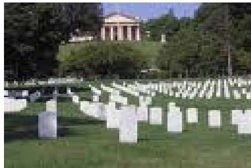
Arlington National Cemetery Where Valor Proudly Sleeps

Take up our quarrel with the foe: To you from failing hands we throw The torch; be yours to hold it high. If ye break faith with us who die We shall not sleep, though poppies grow In Flanders fields.